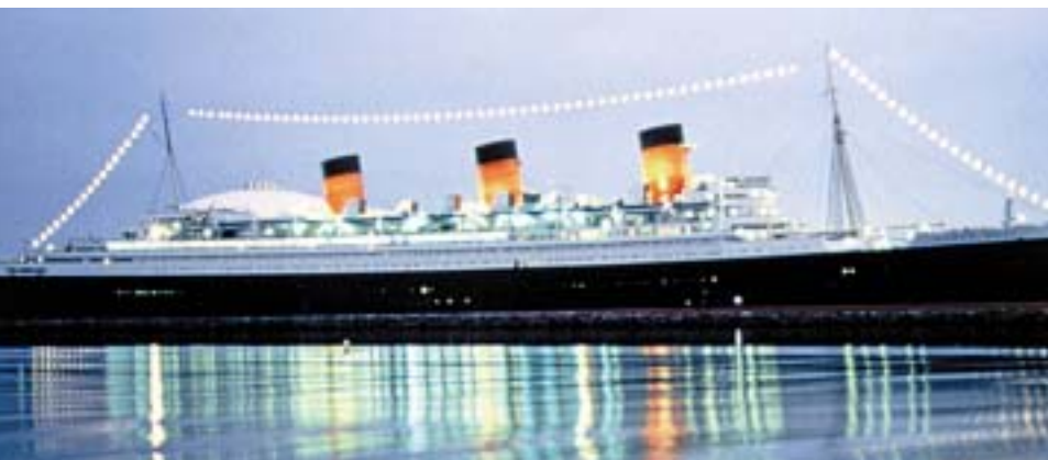
The Queen Mary, once the epitome of luxury and refined art deco design, transported over 700,000 troops during WWII and was praised by Winston Churchill as having helped to shorten the war. After WWII, the Queen Mary was restored to elegance and was used by the elite of the world to cross the Atlantic. The Queen Mary crossed the Atlantic 1,001 times and has enjoyed retirement at Long Beach since December, 1967.