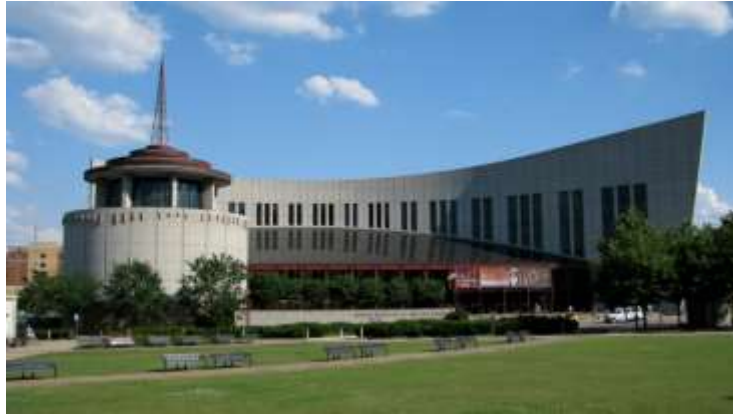
The Country Music Hall of Fame, site of the AOTF Gala.