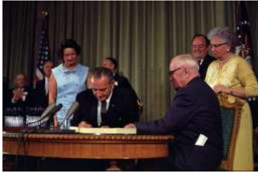
President Lyndon Johnson signs Medicare legislation in 1965.

A large segment of occupational therapy practice is influenced by the federal legislation that created Medicare and Medicaid, now collectively consuming as much of the federal budget as national defense (24%). Signed by Lyndon Baines Johnson, Medicare was not the first attempt to put in place a program of health care for Americans, targeted primarily at persons over 65, which constituted the age group with the largest proportion of persons living in poverty. Today, 40 million seniors and 8 million other individuals, including persons with disabilities or certain terminal illnesses, are covered under Medicare. Read more.